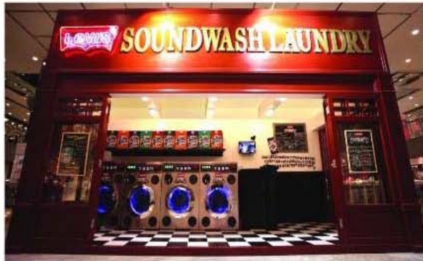
Soundwash Pop Up Laundromat

The Results: Special Edition package sell through up 125% Over 10,000 people visited the Laundromat in just 4 days Levi's spots foot traffic up 100% Over HK$2.5 million of generated in PR coverage