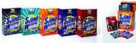
Soundwash Limited Edition Packaging Soundwash limited edition package represented different styles of jeans and music.