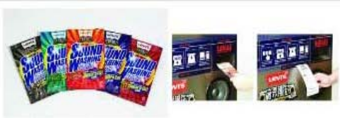
Sound Washing Formula The Sound Washing Formula activated the machine with the chance to win a pair of jeans.